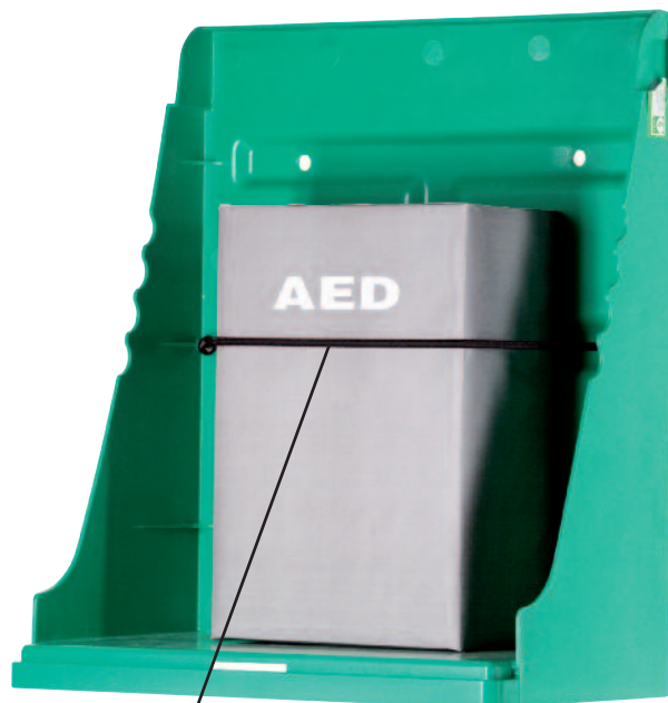
AED holding strap