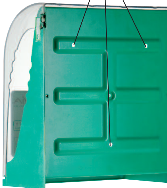
Wall mount holes 8,5 mm